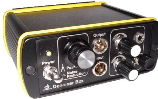
Figure 1. Denoiser Box.

Electrical connectors, controls and LED's are located on the front, rear and bottom panels of the device (see Figure 2 and Table 2 for explanations).